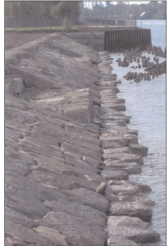
After renovation. Minimal damage to wharf piers with stairway access to water

The Sarnia Chapter helped with the NAS 1 course that was taught in London. The open water portion was done in Sarnia on the Gladstone just off of Canatara Beach.